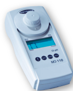
Boiler Water Photometer